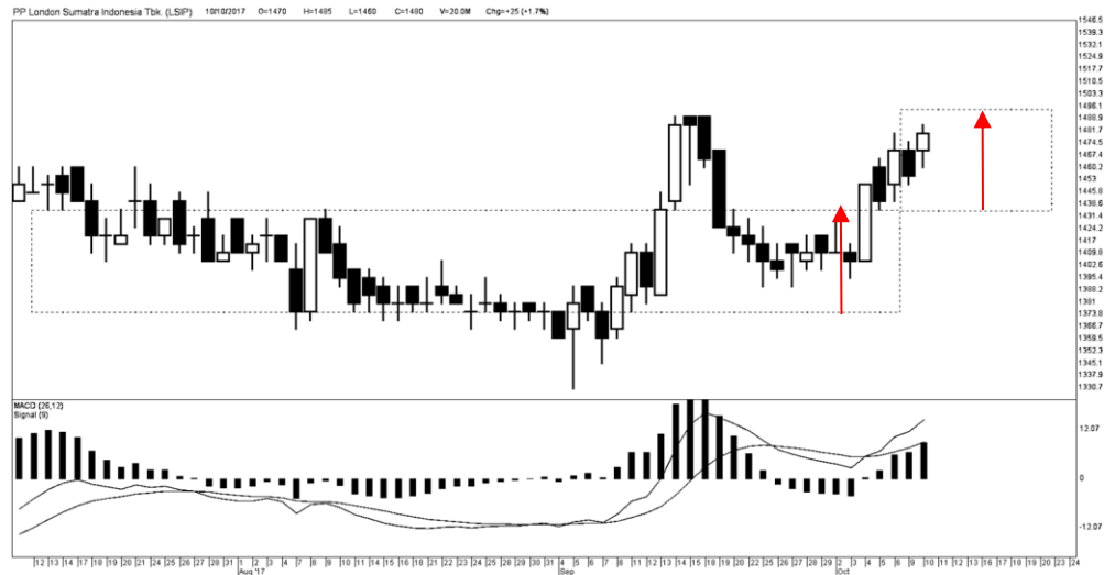
Kinerja saham LSIP

Danareksa research report are also available at Reuters Multex and First Call Direct and Bloomberg